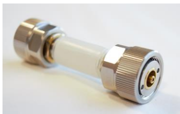
EpsiMu ® 7 mm

With the EpsiMu ® PE13 transmission line, solid materials need to be shaped into a washer of the same internal dimensions as the coaxial line. The external diameter of the propagation line's sample holder is 13 mm, and the internal diameter is 5.65 mm. The thickness of the sample is not set, and it can be comprised between a few millimeters and the maximal length of the sample holder, either 6 mm or 12 mm. When measuring liquids or powdery materials, the sample holder must be completely filled to avoid any measurement errors due to air gaps. The detachable sample holder was conceived to contain any kind of material, thanks to the dielectric partitions that delimitate the confinement area. With this transmission line, one can perform measurements up to 10 GHz.