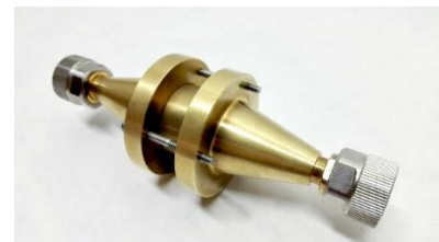
EpsiMu ® PE13