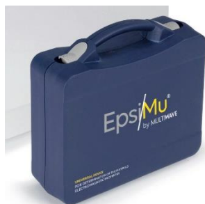
The EpsiMu ® complete kit