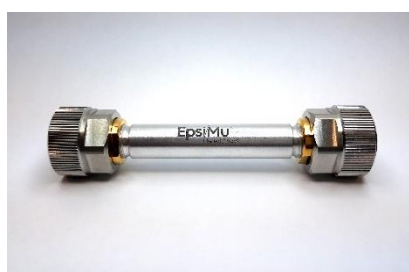
EpsiMu ® 7 mm

With the EpsiMu ® PE13 transmission line, solid materials need to be shaped into a washer of the same internal dimensions as the coaxial line. The external diameter of the propagation line's sample holder is 13 mm, and the internal diameter is 5.65 mm. The thickness of the sample is not set, and it can be comprised between a few millimeters and the maximal length of the sample holder, either 6 mm, 12 mm, 24mm or 30mm. When measuring liquids or powdery materials, the sample holder must be completely filled to avoid any measurement errors due to air gaps. The detachable sample holder was conceived to contain any kind of material, thanks to the dielectric partitions that delimitate the confinement area.