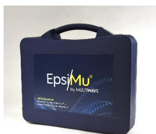
The EpsiMu ® complete kit