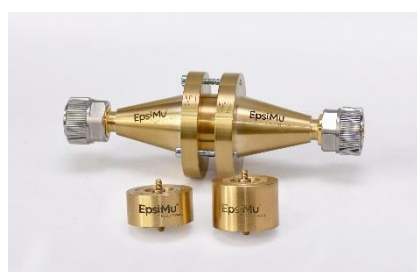
EpsiMu ® PE13 with sample-holders