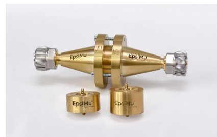
EpsiMu ® PE13 with sample-holders