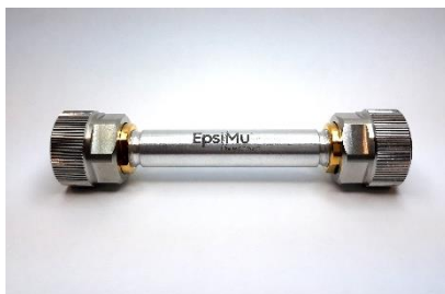
EpsiMu ® 7 mm

With the EpsiMu ® PE13 transmission line, solid materials need to be shaped into a washer of the same internal dimensions as the coaxial line. The external diameter of the propagation line's sample holder is 13 mm, and the internal diameter is 5.65 mm. The thickness of the sample is not set, and it can be comprised between a few millimeters and the maximal length of the sample holder, either 6 mm, 12 mm, 24mm or 30mm. When measuring liquids or powdery materials, the sample holder must be completely filled to avoid any measurement errors due to air gaps. The detachable sample holder was conceived to contain any kind of material, thanks to the dielectric partitions that delimitate the confinement area.