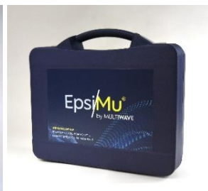
The EpsiMu ® complete kit